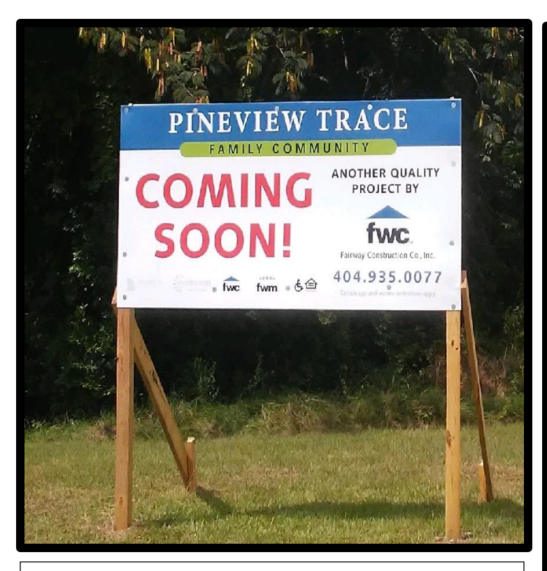
Pineview Trace – A 50 Unit Multi-Family Housing Development